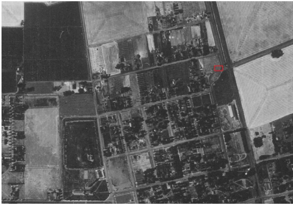
Figure 2: 1937 aerial photograph; site of the subject property outlined in red.

Sources: City of Davis, Planning and Building Department.