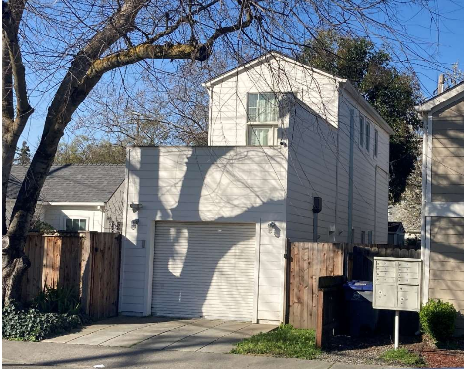
Figure 1: A detached garage/guest house constructed ca. 2005 is located at the north end of the subject property. View facing southwest.