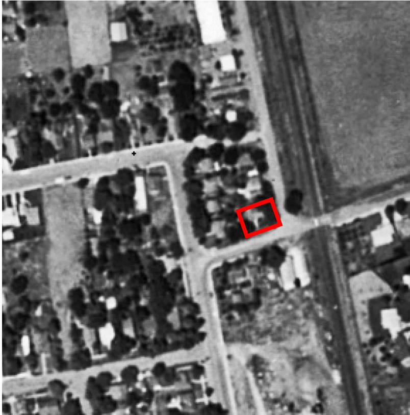
Figure 3: 1957 aerial photograph; subject property outlined in red.